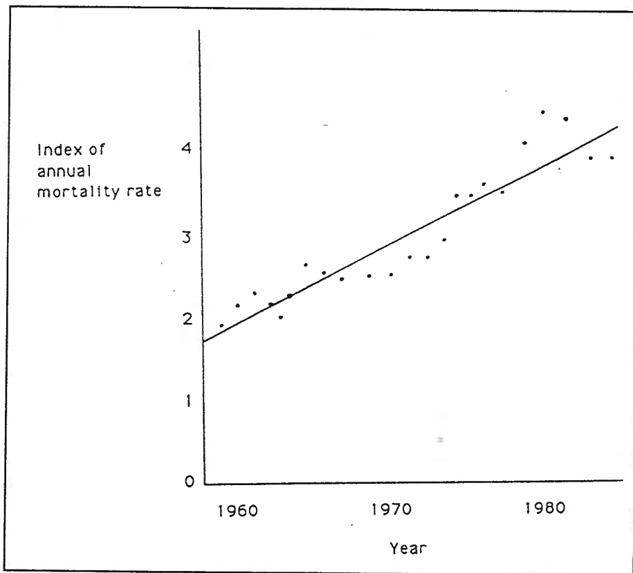
Figure 3. An index of the annual mortality rate of Danish dairy cows calculated from slaughter-house data over a 22 year period (data from Agger 1983).

immune system can work effectively to counteract pathogen challenge. If there is immunosuppression, however, then the individual will have greater difficulty in coping with environmental effects and must show some of the pre-pathological effects discussed by Moberg (1987). These effects also have the potential to reduce fitness so for both of these reasons the welfare is poorer than in an unaffected individual. It may well be that the immunosuppressed individual does not suffer because it is not challenged by pathogens, but the immunosuppression itself means that there is an effect on its welfare. If successful pathological attack occurs as well, with consequent morbidity and suffering, then the welfare is even poorer (Figure 1). As mentioned earlier, we cannot as yet be sure how to equate these different measures of welfare, but measurements of the severity of effects may be similar during injury and disease.