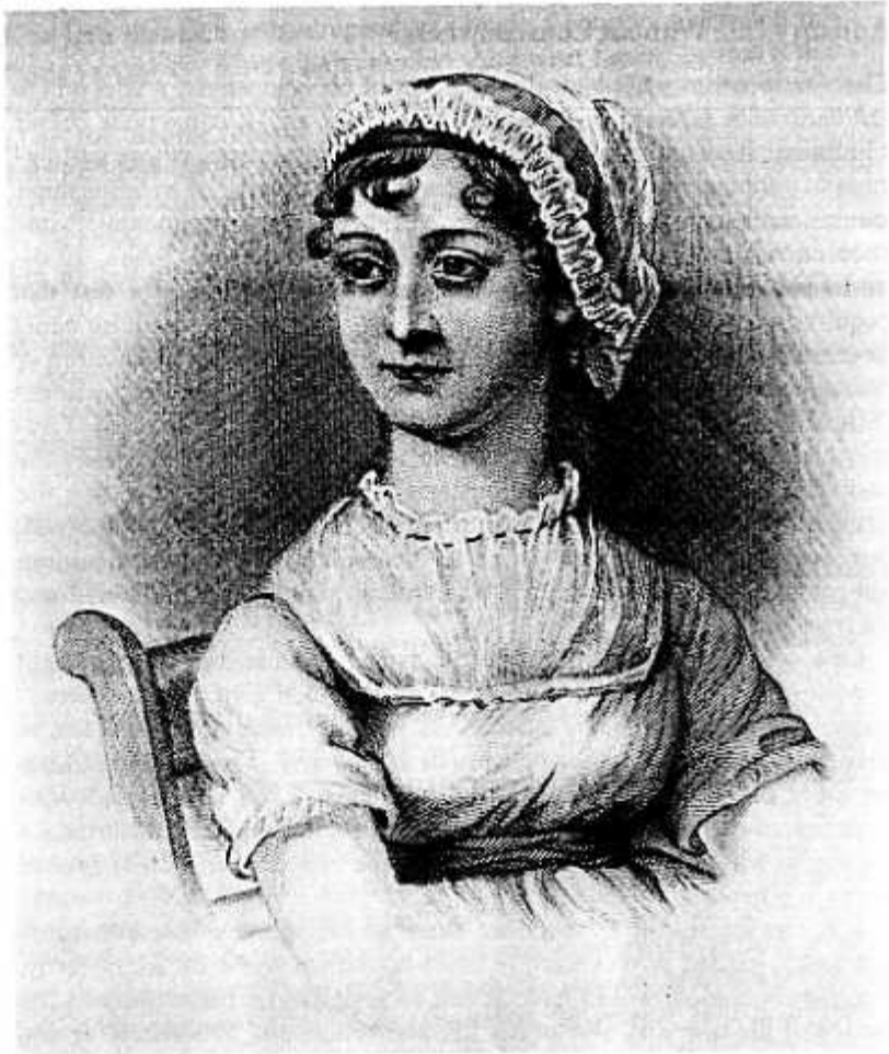
Figure 24.4 Jane Austen (1775–1817), another super-conscious person. Did she have introspective powers that exceeded normal bounds and limits, thus giving her superior knowledge of the causes of people's beliefs and actions.

hold to be just our brains' direct response to a stimulus in the external world. The rather complete physiological and psychological knowledge we possess of such peripheral sensory processes seems at first to support this notion, for it might be thought to imply that there is no room for communication and interaction in generating the experience. I do not think this view is correct because current knowledge does not explain how sensory experiences acquire their labels, and for a number of other reasons.